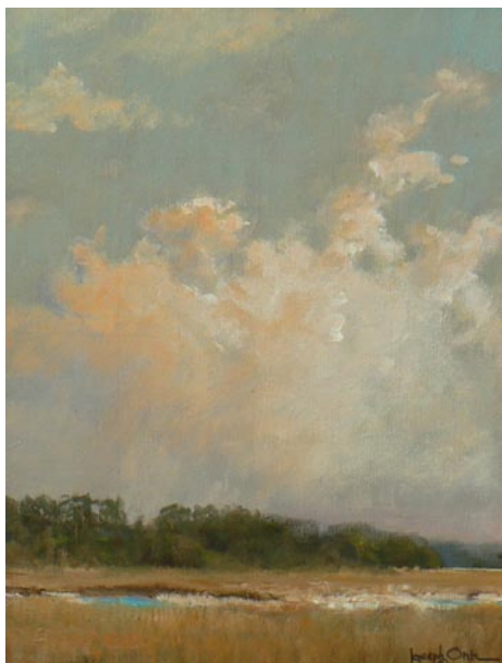
Work by Joseph Orr

The Sylvan Gallery in Charleston, SC, will present the exhibit, Joseph Orr: A Delicate Balance , featuring new paintings on view from Oct. 7 - 31, 2011. A reception will be held on Oct. 7, from 5-8pm.