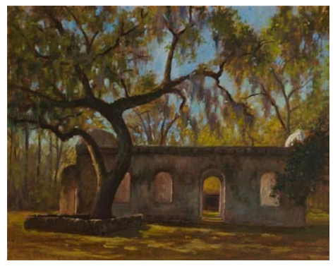
Work by Christian Snedeker

Snedeker spends countless hours scouting the outlying areas to prepare for these works, studying the natural surroundings and how light falls through the trees, casts shadows, and creates a magical setting.