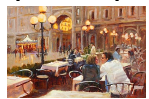
Work by Laurie Meyer

Meyer's recent series One Light features twenty large-scale oil paintings that capture the sensation of light. She says, "Whether the subject is a historic street in Charleston or abroad, we are all under this 'one light.' In other words, the subject doesn't re-