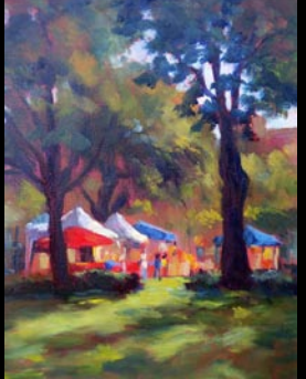
Painting by Ruth Cox

Glass Blowing Demonstrations at 209 Laurel Street are Free! 11 am – 4 pm. Watch as glass blowers create colorful works of art from 2100 degree glass.