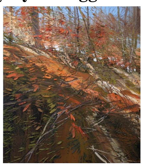
Work by Lynn Boggess garage just up the hill, as well as street parking.

The Haen Gallery is located on Biltmore Avenue between the City Bakery and ED Boudreaux's. There is a parking garage at