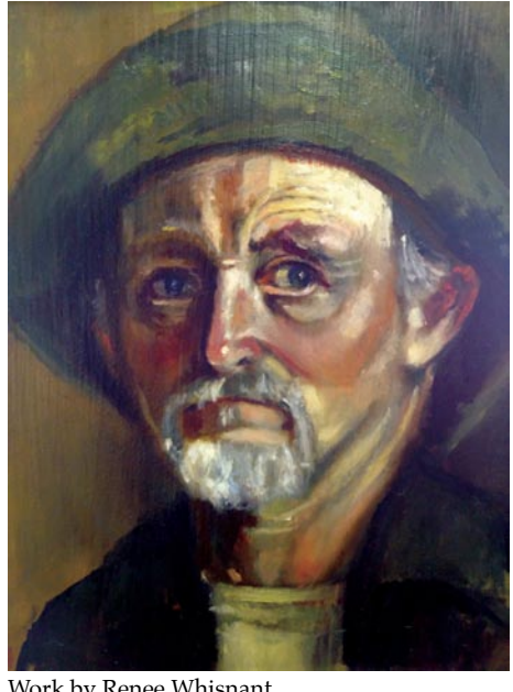
Work by Renee Whisnant

A Study on Beauty will feature completed works as well as studies and sketches revealing processes and subjects rendered in the classical style.