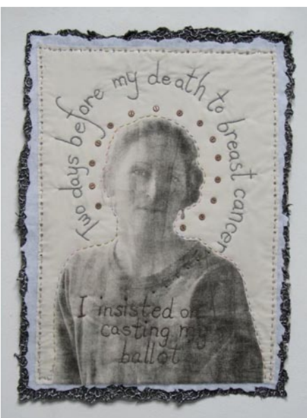
Work by Susan Lenz

Lenz offers the following statement, "From rising to dying, people make decisions. Some are profound; some are routine; some have significant repercussions; others are cause for celebration. In each instance,