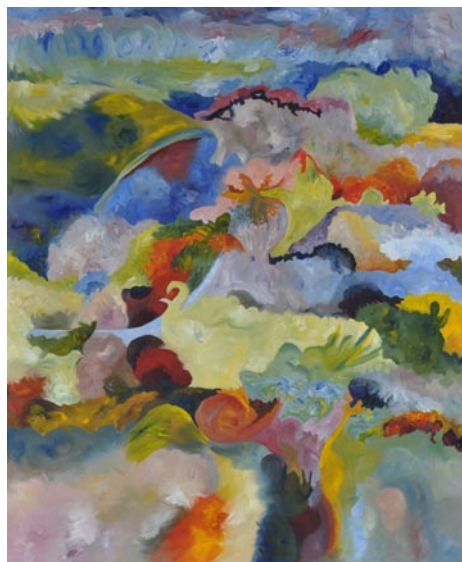
Work by Linda Hudgins

Founded in 1889 and located in the heart of Spartanburg - home to six colleges and 13,000 college students - Converse helps women develop the skills necessary to balance a full life. Students develop their unique voices through