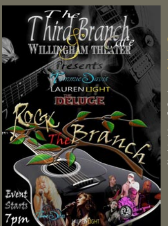
Rock the Branch 2013 7-9pm $20 A musical evening and

dinner hosted by the Third branch Café featuring an electic mix of country, pop and soft rock.