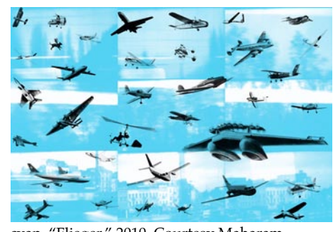
cyan, "Flieger," 2010

Today, design is all around us. We're immersed in it. It permeates our daily lives, influences our behavior and is defining the human experience as a strikingly visual one. Once the exclusive domain of skilled professionals, new tools, channels and software have emerged in the last decade to create opportunities for anyone to design, distribute and put their ideas on display. With Graphic Design: Now In Production , come explore design as it exists today - in a state of constant reimagination.