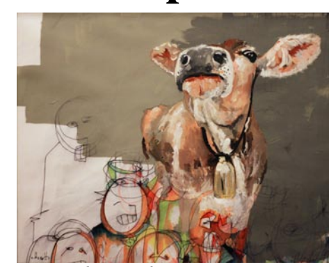
Work by Chad Beroth

Art Nouveau Winston-Salem is an affiliate organization of The Arts Council of Winston-Salem and Forsyth County for