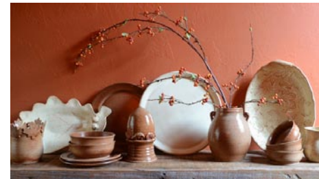
Works from Thomas Pottery