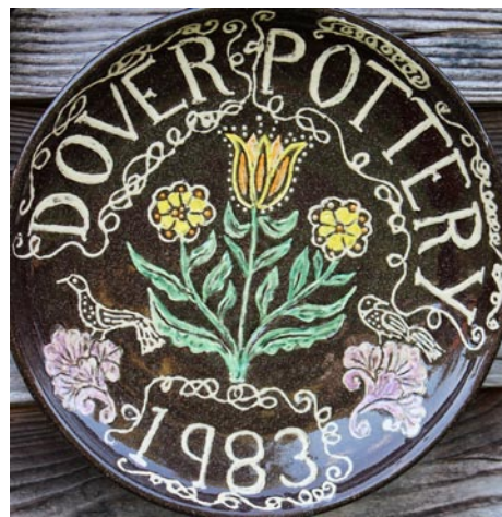
Work from Dover Pottery from 1983