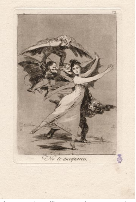
Plate no. 72 You will not escape | No te escaparás by Francisco Goya.

Francisco Goya's Los Caprichos etchings, one of the most influential graphic series in the history of Western art, is being presented at the Jones-Carter Gallery in Lake City, SC, through Saturday, Jan.