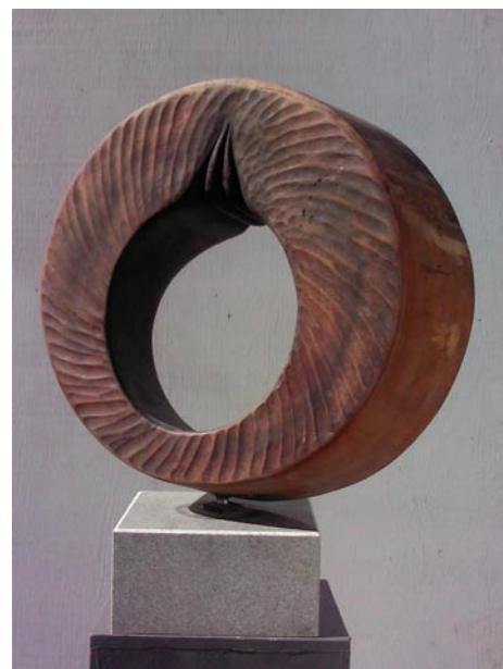
"God" by Enzo Torcoletti

Also in October, two community workshops in the ceramic studio at Case Art Building will allow participants to work right alongside Torcoletti. The first workshop will be held on Saturday, Oct. 17, from 10am to 4pm. This program focuses on ceramic sculpture. The second workshop is scheduled for Saturday, Oct. 24, also from 10am to 4pm, with a focus on stone carving. Both workshops will feature demonstrations from the artist, and materials will be provided. There is no cost to attend these events, but reservations are required, and