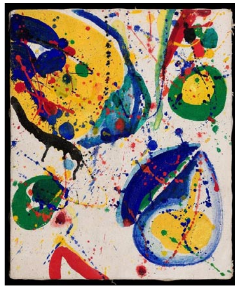
Sam Francis, "As for Appearance II", oil on canvas, 1963-1965

Bechtler Museum of Modern Art , Levine Center for the Arts, 420 South Tryon St., Charlotte. Through Jan. 18, 2016 - "Portraying the Patron: Andy Warhol and the Bechtlers". On June 3, 1968, the militant feminist writer Valerie Solanas shot Andy Warhol at The Factory, his famous studio/club house in New York City. Although two bullets missed Warhol, the third went through his spleen, liver, stomach, and esophagus. He almost died during the five-hour surgery that followed, and remained bedridden for three months afterward. While at home, he painted small portraits of Mrs. Nelson Rockefeller, marking his return to portraiture, a theme that had preoccupied him since the 1950s and dominated his output for the remainder of his life. Through commissioned portraits, Warhol could control his public interactions and reliably earn a living. Through Mar. 7, 2016 - "Sam Francis: Rapid Fluid Indivisible Vision," will not only present the distinctive art Francis created, but will position him among the various artists whom he celebrated and influenced. The