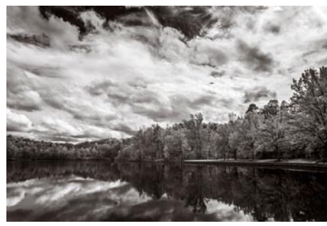
Work by Will Willner

Crows are among the most intelligent birds. Despite their intellect, crows are often represented as harbingers of dangerous times and symbols of death portrayed in dark and impressionistic tones. Contemplating Crows illustrates this dichotomy.