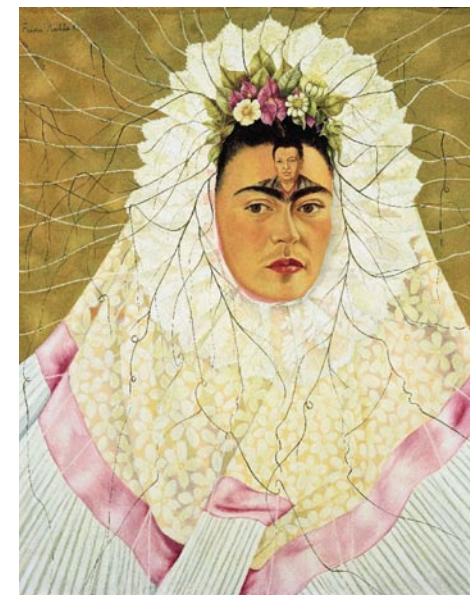
Frida Kahlo, "Diego on My Mind", 1943, oil on Masonite, 29 7/8 x 24 in., The Jacques and Natasha Gelman Collection of 20th-Century Mexican Art, The Vergel Foundation, Conaculta/INBA, © 2019 Banco de México Diego Rivera Frida Kahlo Museums Trust, Mexico, D.F./Artists Rights Society (ARS), New York