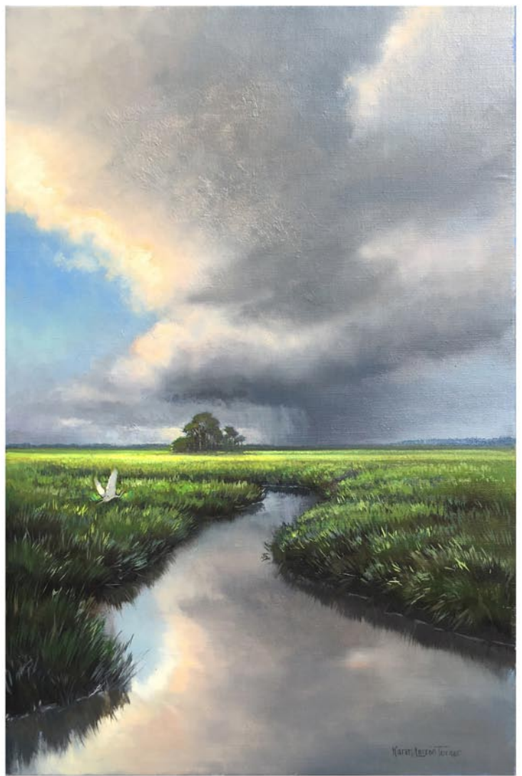
KAREN LARSON TURNER, CUMULUS RISING , 40x20, OIL ON LINEN