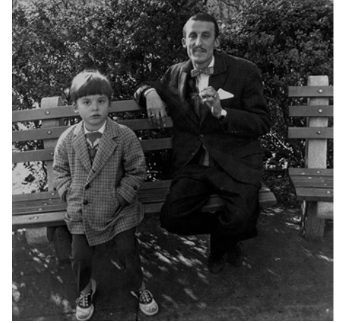
Diane Arbus, "Man and a Boy on a Bench in Central Park, NYC", 1962, gelatin silver print, 20 x 16 in. Weatherspoon Art Museum. Museum purchase by exchange, 2012. © Diane Arbus

These works drawn from the museum's collection explore familial relationships, be they between mother and child or self-identified families, and less fixed, but equally important ties - to lovers, friends, and even objects. And, because life can be arduous at times, the tension, separateness, and alienation that result from unhealthy ties or from a lack of connection are also considered.