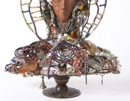
ADAM WENSIL Off Kilter, found object sculptures