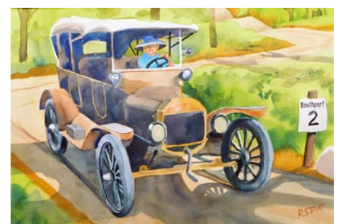
Work by Richard Staat

Located in coastal Brunswick County, Sunset River Marketplace caters to both tourists and a growing local community of