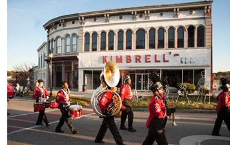
Christmas Parade Project - 2017 Chester Parade by Phil Moody

828/295-9099 or visit (BlowingRockMuseum.org).