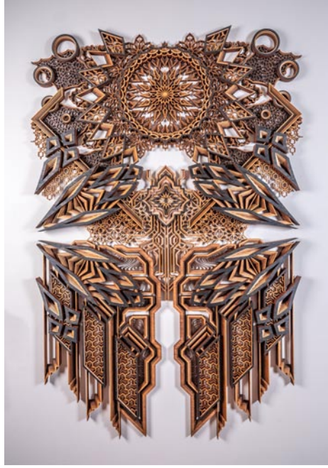
One of the pieces featured in BRAHM's Branching Out exhibition by Zak Weinberg (Raleigh, NC). Truth , 2018. Lasercut, stained, birch ply.

goner, on view through Oct. 24, 2020. Frontyard, Backyard, Street, a group exhibition offering reflections on urban Charleston, invites the neighborhood to share five artist's sense of place in their city landscapes. The artists use a variety of media to depict their interpretation of a watermark in time. The surrounding street blocks team with energy and layers of stories as the hustle of the day transpires. Works use this visual language as theme, celebrating the vibrancy, while also considering the inevitable change of our city landscape. The artists consider: What is the character of Charleston? What is it that is precious and what history is necessary to protect and tell? For further information call the Center at 843/722-0697 or visit (www.reduxstudios.org).