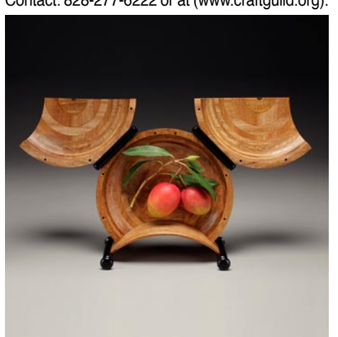
"It Takes Two to Mango" by Ray Jones and Jim Sams

Southern Highland Craft Guild, Biltmore Village, 26 Lodge Street, former Biltmore Oteen Bank Building in Biltmore Village, Asheville. Ongoing - Featuring a wide range of work by members of the Southern Highland Craft Guild. including: pottery, glass, wood, jewelry, fiber, metal, paper, mixed media and natural materials. Hours: Mon.-Sat., 10am-7pm & Sun. noon-5pm. Contact: 828-277-6222 or at (www.craftguild.org).