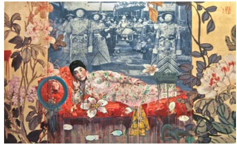
Work by Hung Liu

As a formative dimension of the human condition, focus on home is a constant in the