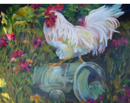
Work by Judy Adamick

WWW.CITYARTONLINE.COM 803.252.3613 - 1224 LINCOLIN ST. COLUMBIA, SC 29201