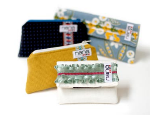
Works by Nana by Sally, LLC.

From Chattanooga, TN, comes another new Crafty Feast vendor, Sweetcycle Apparel. This particular vendor has a wonderfully crafty back-story: Sweetcycle Apparel was born in Kenmare, Ireland, during an extended backpacking trip. Necessity to be creative with whatever they had or were able to find forced SweetCy-