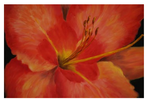
Work by Dorothy Buchanan Collins

Mica is a cooperative gallery featuring the fine contemporary craft work of 11 member artists all from the immediate area. Available for sale is a variety of