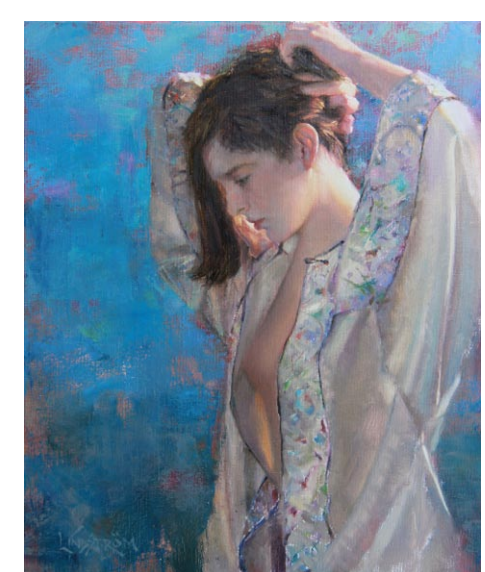
Work by Bart Lindstrom

Commercial Gallery listings, call the gallery at 828/817-3783 or visit (www. skyukafineart.com).