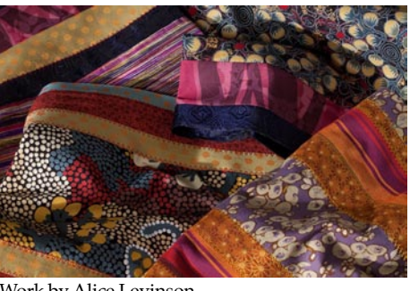
Work by Alice Levinson

HGA not only offers gift certificates but has a Wish List Book that allows customers to select the perfect gift for themselves and have the gallery contact the person they hope will purchase it. Purchases can even be completed over phone with the gift either picked up at the gallery or shipped.