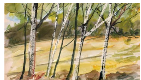
Landscape by Tom Flowers

In The Other Brother Higby weaves together interviews with the sisters, who knew Jessie best, with interviews of Tom Flowers, who hadn't spoken with him since they were young men. The result is a living portrait of a man who has depth and compassion and who wasn't without a sense of humor and who also was a very good writer. One of the most wonderful aspects of the film is how Higby pairs drawings and sketches by the two brothers. Jessie's work feels crowded, humorous and primordial while Tom's feels much more open, airy and contemporary. Yet by pairing the images Higby sets up a kind of artistic dialogue between the brothers that somehow transcends their decades of estrangement. Toward the nd of the film we sense that Tom, looking through family photographs and Jessie's sketchbooks, gets to know his brother in a way he never knew him in life. And that of