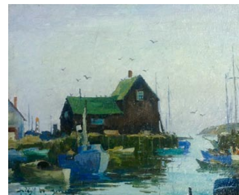
Work by Harry DeMaine

Flanders Art Gallery , 302 S. West Street, Raleigh. Ongoing - Featuring a fine art gallery dedicated to the promotion of national and international artists, providing fine art to established and new collectors, and catering to special events in support of fine art. We offer sculpture, painting, photography, illustrations, engravings, and other works on paper by emerging and established artists in a range of styles. Also offering art appraisal by an ISA educated appraiser and art consultation. Hours: Wed.-Sat., 11am-6pm. Contact: 919/834-5044 or at ( www.flandersartgallery.com ).