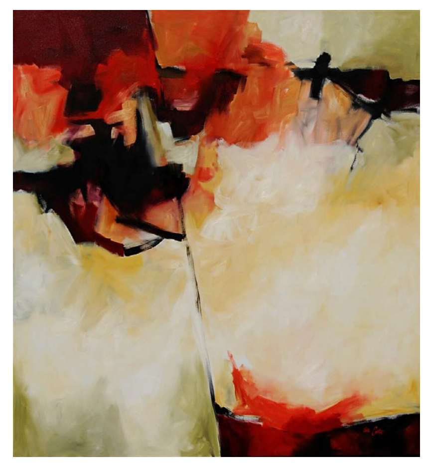
Fracture Oil on Canvas, 72 x 66 inches