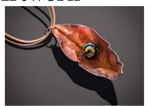
Work by Rosemary McLeod

At the heart of this exhibit is the Co-op's mission to give its more than 50 members as many opportunities as possible to produce, show, and sell their artwork. But the timing of this exhibit during the Holidays is no coincidence. "First, we want to bring in new visitors to view