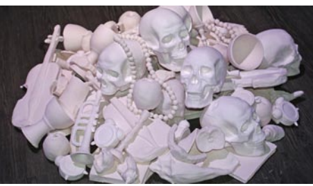
Work by Kimberly Riner

She is actively involved in growing the art scene in the Statesboro area where she