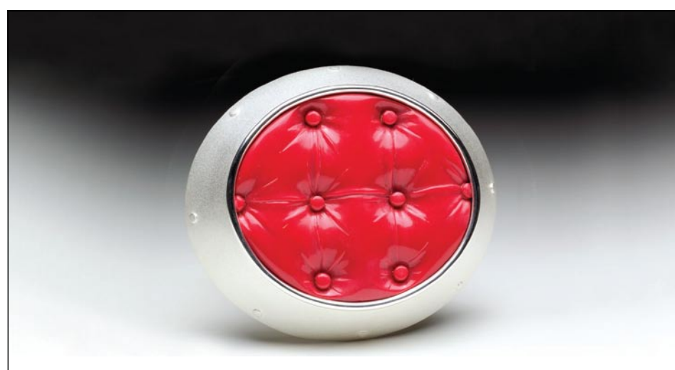
FINE LINE BETWEEN PRICELESS AND WORTHLESS

People who need something above the couch, in the kitchen, down the stairwell can chose from photographs, pencils and charcoals, oils, watercolors, acrylics, silkscreen, and paintings on handmade paper. Textiles are covered in handspun yarns, hand-woven flat goods, sculptured dolls, and garments pieced, painted, and stitched. There are soaps and scents and some things that truly make one wonder, "How did they do that?" Each tour is unique. Some artists have participated in all. Others come and go with the seasons. And if you can't get to it all, and you won't, don't worry, There's another tour the first weekend in June. Bright studio signs point the way from studio to studio, from gallery to gallery, from one unique work environment to another, And a free 40+ page full color guide directs you to each. All the information will be available at the website, (www.toeriverarts.org). The guide will be available at locations around the two counties. For more information, e-mail to (trac@toeriverarts.org) or call 828/682-7215.