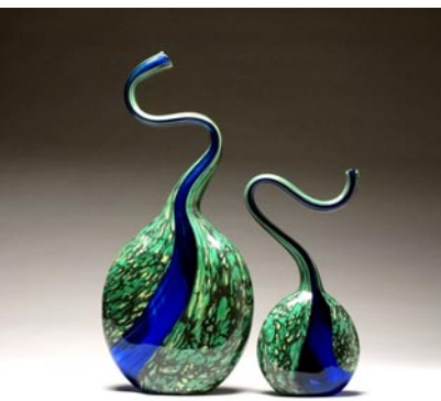
Works by Michael Hatch

media works are intimate, drawing in the viewer. The effect is accomplished through an aura of nostalgia and historical reference, but also her materials and exquisite tints of color. The three women are new arrivals to the Tryon area.