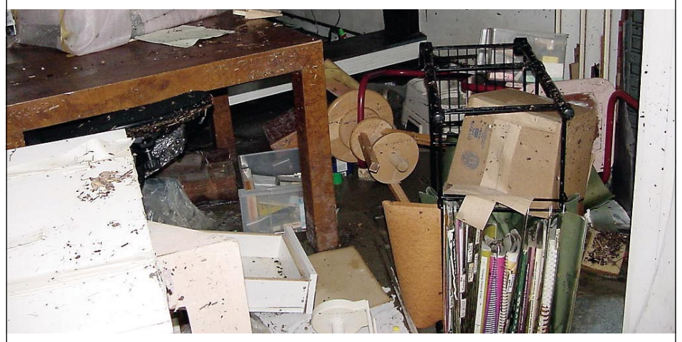
Artist Diane Falkenhagen's Texas studio — destroved by flooding during Hurricane Ike, 2008

What would you do if you lost your work, your tools, your images, and a lot more to a flood? Metalsmith Diane Falkenhagen knows