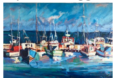
Work by Sue Scoggins

'Without artists there would be no Ancient Greek architecture, no painted ceil-