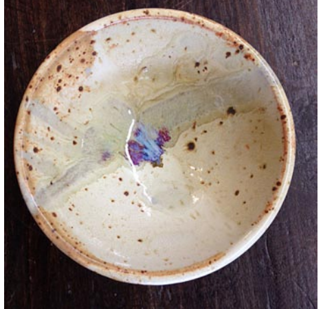
Work from Wyndham & Brooke Haven Pottery

The 38th annual Seagrove Pottery Festival takes place at the Seagrove Elementary