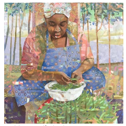
Work by Kevin Chadwick

"My work seems to be ever-evolving, but I am still drawn to and fascinated by strong African American figures. Where my recent works have taken me, is as the role of a storyteller. Whether a lone figure in my patterned background or a family scene, I now try to include a bit of history or a touch of