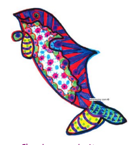
Check my website for new whimsies!