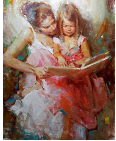
Work by Kevin Beilfuss

listings, call the gallery at 843/727-4500 or visit (www.mgalleryoffineart.com).