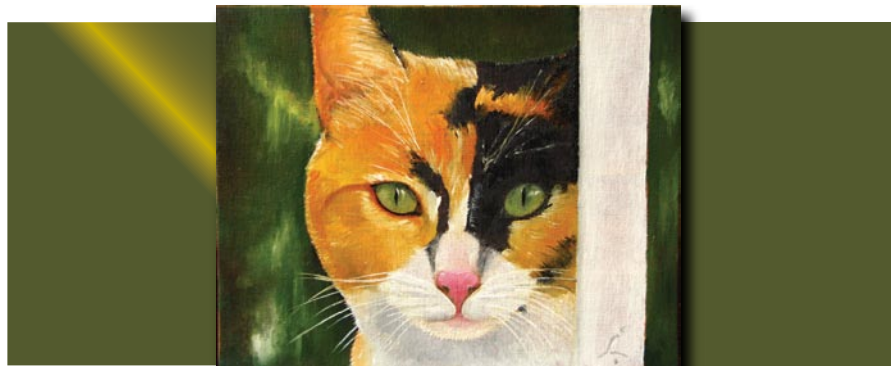
"Shasta - New Visitor" 8"x10" oil on board / Framed 12"x14" ( $500.00 )