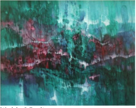
Work by J. Bardin

Over 500 paintings, sculptures and original prints are kept in inventory. Changing exhibitions, artists' talks, and special events provide educational opportunities for all. Consultation is available for private and corporate collections. The public is invited to all events.