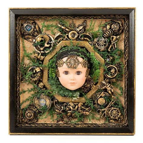
Work by JoAnn Borovicka, part of the "12 x 12" exhibition

For further information check our SC Institutional Gallery listings or visit (https://www.greenvillearts.com/).