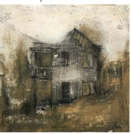
Morgan Kinne, "House Downtown", 2020, Paint, Ink and Charcoal on Plywood, 24"x24"

"My work draws inspiration from the classics I've read set in the American Colonial and Early Victorian eras. These texts allow me to glimpse the feminine spirit where women are expected to follow societal constraints. Women must use what power they have to make lives for themselves. This power can be found in the way the women dress and carry themselves."