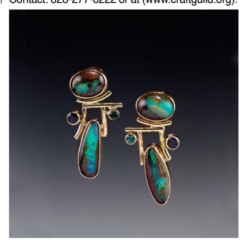
Works by Ruthie Cohen, at virtual Crafts Fair

Southern Highland Craft Guild, Biltmore Village, 26 Lodge Street, former Biltmore Oteen Bank Building in Biltmore Village, Asheville. Ongoing - Featuring a wide range of work by members of the Southern Highland Craft Guild. including: pottery, glass, wood, jewelry, fiber, metal, paper, mixed media and natural materials. Hours: Mon.-Sat., 10am-7pm & Sun. noon-5pm. Contact: 828-277-6222 or at (www.craftguild.org).