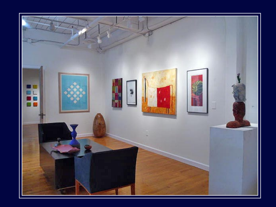
businesses and individuals. By Appointment

For further information check our NC Commercial Gallery listings, call the gallery at 704/377-6400 or visit (www.redskygallery.com).