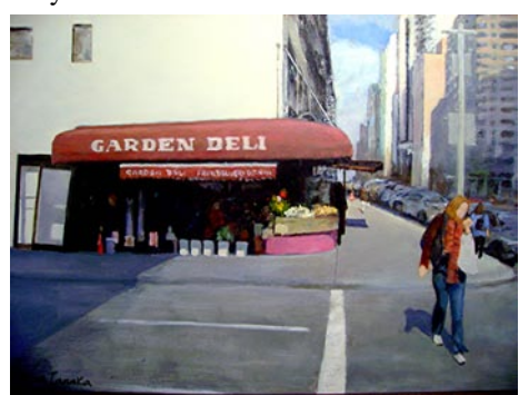
Work by Akira Tenaka

The gallery artists capture the flavor of urban living on canvas in poignant depictions of favorite destination spots from nearby historic Charleston and Savannah to Manhattan and beyond the US to Europe, including the winding streets of Italy and France.