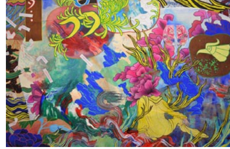
Jiha Moon, "Yellow Wave" (detail), 2013, ink, acrylic, glitter, and embroidery patches on Hanji paper, 50 \times 90 in. Courtesy of the artist, Saltworks Gallery, Atlanta and Curator's Office, Washington, DC.

Unique images of nature created by Japanese artists from the Edo period (1615-1868) through the twentieth century will fill the Tannenbaum Gallery this spring in the exhibit, Bugs, Beasts and Blossoms: Japanese Woodblock Prints from the Dr. Lenoir C. Wright Collection. The two principal artists responsible for introducing this theme to the woodblock print art form were Hokusai (1760-1849) and Hiroshige (1797-1858). Later artists continued their custom of directly observing nature and imbuing its flora and fauna with symbolic meanings. For example, certain blossoms and birds represent specific seasons while particular animals signify distinct attributes or human mannerisms. Each picture offers delight in itself, while the exhibition as a whole conveys Japan's deep-rooted appreciation of the natural world and its unique aesthetic sensibility. These prints were gifted to the Weatherspoon by Dr. Lenoir "Len" Wright (1911-2003), professor emeritus of History and Political Science at the University of North Carolina at Greensboro. His passion for Asian culture resulted in a collection of over 600 objects that he began donating to WAM in 1978. Jiha Moon will give an Artist Talk on Jan. 16, from 5:30-6:30pm. For further information check our NC Institutional Gallery listings, call the Museum at 336/334-5770 or visit (http://weatherspoon.uncg.edu/).