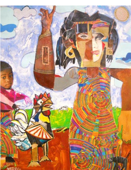
Work by Eric McRay

in 1913. Reality displaced realism as an artistic concern and throughout the twentieth century; the camera, the automobile and the mushrooming urban experience amongst other things shaped reality. With assemblage, odd found objects, even junk, from chewing gum to cuckoo clocks, are collected and fabricated into sculpture to express ideas and possibilities from deeply meaningful to comical.