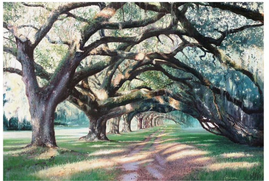
GARY GOWANS, OLD MEN OF DIXIE , 20x26