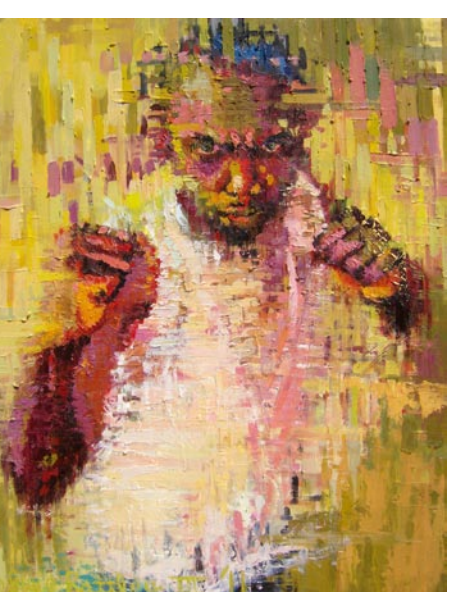
Juie Ratley III, Get the Message, 2011, oil on panel, 30 x 24 inches

According to curator Edie Carpenter, in these works, viewers "overhear a wonderful conversation between artists from different ages in works that as a collection comprise a pictorial equivalent of the process of reimagining and reinvention that itself has a long history." In a later work in this collection Self Portrait as a Moonflower (2012) Janschka paints himself "emerging from a flower at some indeterminate age in the past," claiming that he has "not always succeeded in 'mastering the masters,' I hope they will forgive my lack of skill and continue revealing their