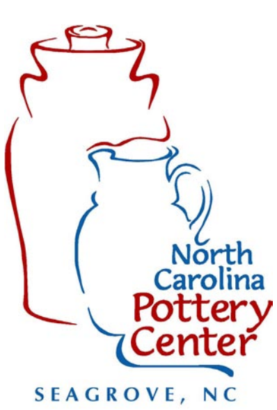
Museum Hours: Tues-Sat 10am-4pm Business Hours: Mon-Fri 8:30am-5pm

Greenhill is located on North Davie Street, in the Greensboro Cultural Center. Greenhill promotes the visual arts of North Carolina by engaging a broad community of artists, adults and children through dynamic exhibitions and educational programs while providing a platform for exploration and investment in art. For further information check our NC Institutional Gallery listings or visit (www.greenhillnc.org).