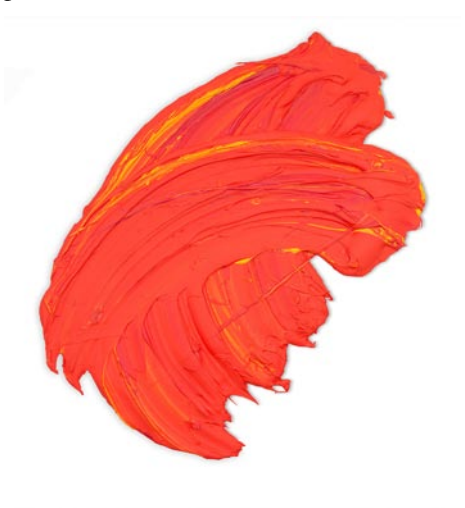
Work by Donald Martiny

The exhibition features the work of four artists who explore color and gesture in works that utilize variations of hue to ravish the eye. Whether through building up transparent layers or creating saturated zones of pigment, these artists investigate the evocative power of color in works that include still life paintings, textile compositions, wall reliefs and abstract cartographies.