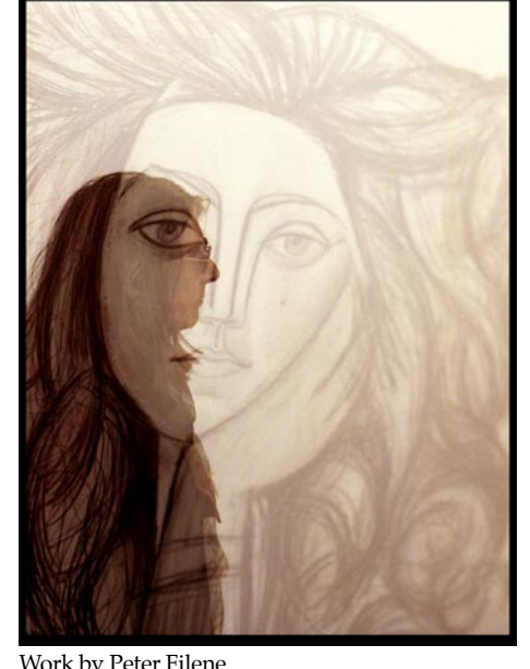
Work by Peter Filene

Filene has also been shooting straight photographs of peeling posters on city walls. "Partly buried faces, words, and patches of color break through the surface, creating ready-made collages. It's as if we're looking back in time, like the lay-