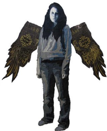
"Ellie" by Jim Arendt, 2012, denim applique, 67 x 70 inches.

Our policy at Carolina Arts is to present a press release about an exhibit only once and then go on, but many major exhibits are on view for months. This is our effort to remind you of some of them.