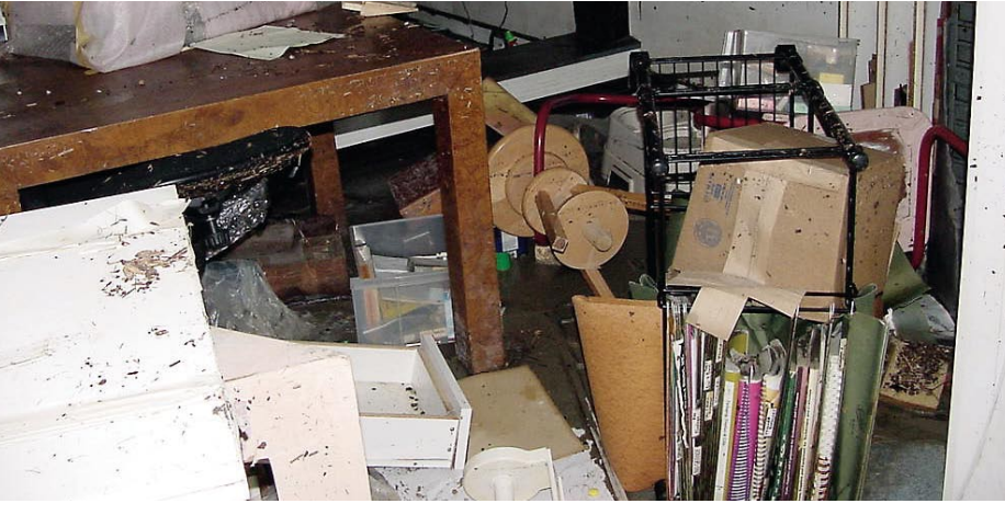
Artist Diane Falkenhagen's Texas studio — destroyed by flooding during Hurricane Ike, 2008

What would you do if you lost your work, your tools, your images, and a lot more to a flood? Metalsmith Diane Falkenhagen knows