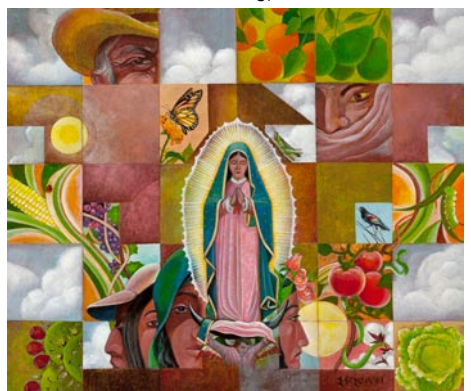
Work by José Esquivel

Jackson County Green Energy Park, 100 Green Energy Park Rd., Dillsboro. Ongoing - Featuring art created with renewable energy featuring blown glass, forge-hammered metals, ceramics. The Jackson County Green Energy Park (JCGEP) utilizes clean, renewable energy resources to encourage economic development, provide environmental protection, and offer educational opportunities that together will help lead towards a more sustainable future for Western North Carolina. Hours: Tue.-Thur., 1-4pm & Sat., 10am-4pm. Contact: 828/631-0271 or at (www.jcgep.org).