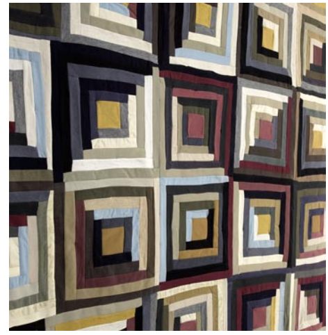
Work by Sean Riley

Redux Contemporary Art Center is a Charleston, SC nonprofit organization committed to the fostering of creativity and the cultivation of contemporary art through diverse exhibitions, subsidized studio space for artists, expansive educational programming, and a multidisciplinary approach to the dialogue between artists and audience. Housed within a 10,000 square foot warehouse are two galleries, 22 private artist studios, print shop, darkroom, woodshop, classroom, and film-screening area. Redux is committed to showing artwork by national and